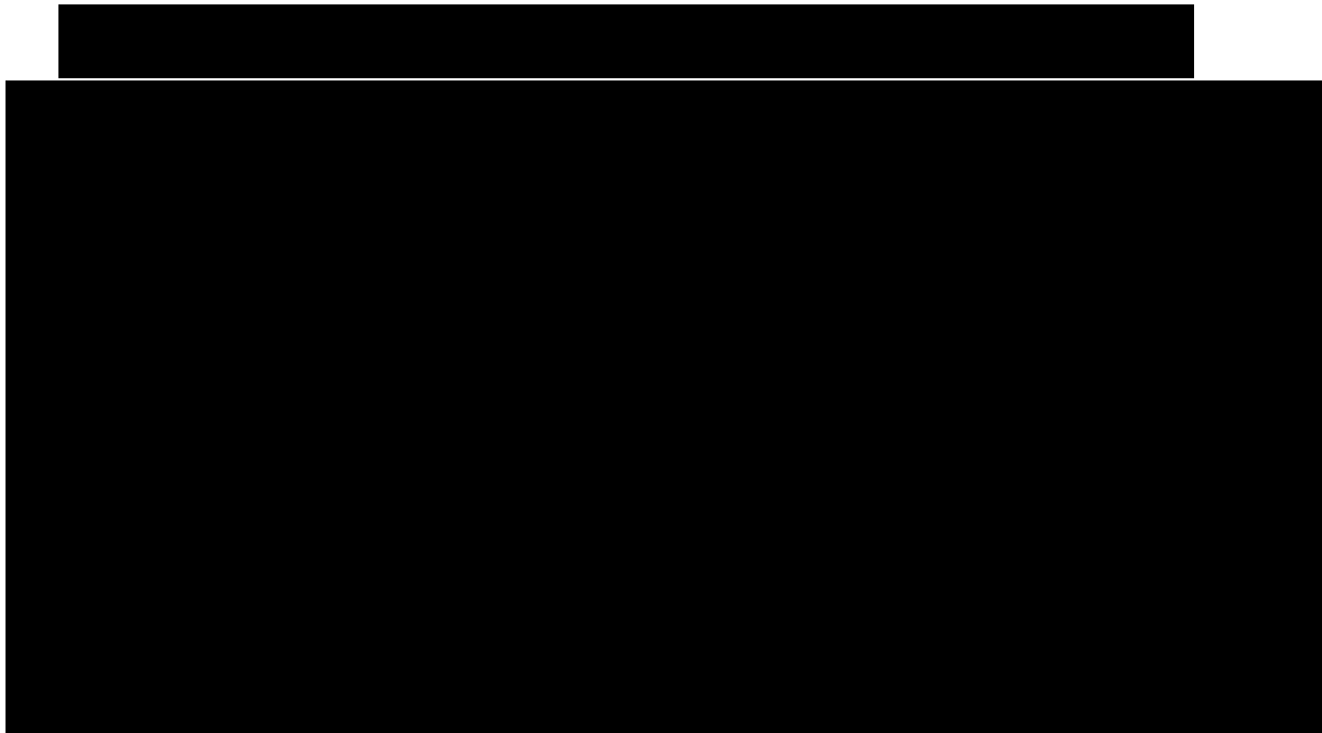
View from the B1023 showing our house and front boundary hedge.